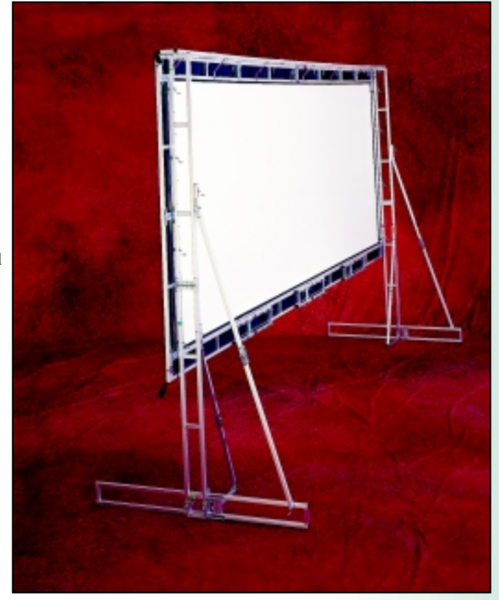
View of Truss-style Cinefold from the back of the unit.