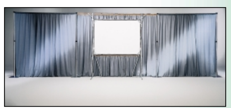
View of Cinefold with Pipe & Drape Runoffs from the back of the unit.

Specifically designed for use with the CINEFOLD and CINEFOLD DRESSUP KIT. Extends the theatre-like appearance of CINEFOLD draperies to the right and left of the screen to any desired distance, in 10' increments. Sets up in minutes, creates a professional-looking stage anywhere. Completely freestanding, infinitely adjustable to any height or width. Patented Slip-Lok release allows infinite height adjustment between minimum and maximum levels. Sturdy, inconspicuous flat steel bases.