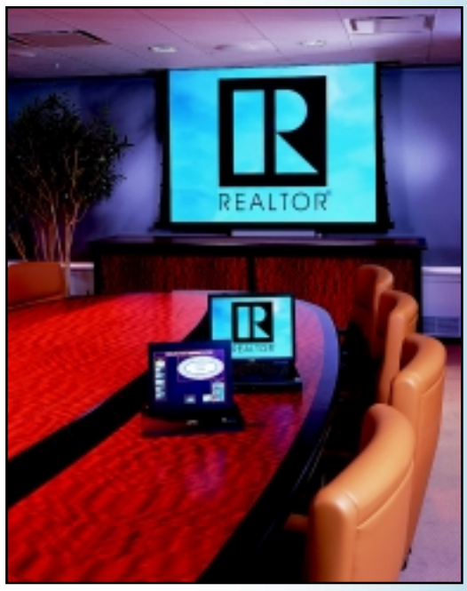
Photo: National Association of Realtors, Chicago, IL. Dealer/Installer: United Visual, Inc. Awarded Grand Prize—Conference Rooms, Presentations Magazine, April 2000.