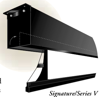
Sizes through 12' wide