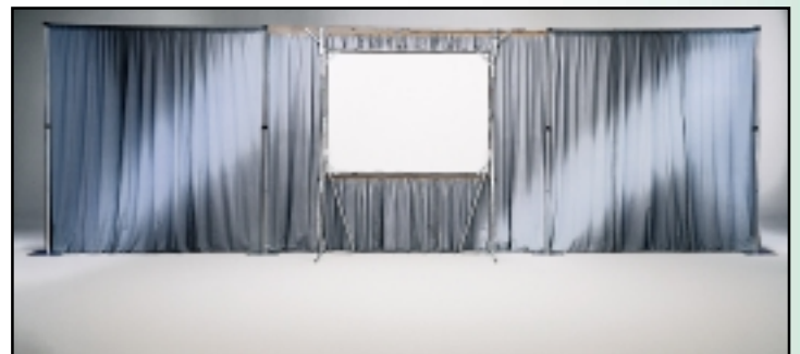
View of Cinefold with Pipe & Drape Runoffs from the back of the unit.

Four fire-retardant drapery fabrics available: Traditional 20 oz. cotton velour, 90% opaque; VELLITE, 12 oz. brushed polyester, with a wrinkle-resistant, crushed finish; POLYKNIT, 10 oz. satiny polyester; and CLASSIC TWILL, 12 oz. wrinkle-resistant polyester. Velour, VELLITE, and POLYKNIT are available in navy blue and black. CLASSIC TWILL is offered in 24 colors, including black and navy blue. Drapery panels hemmed top and bottom to accept horizontal drapery supports.