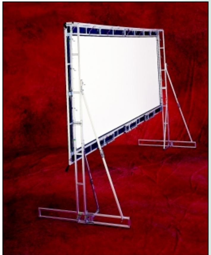
View of Truss-style Cinefold from the back of the unit.